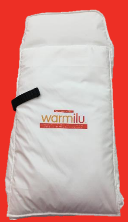
Newborn Plus (Large)